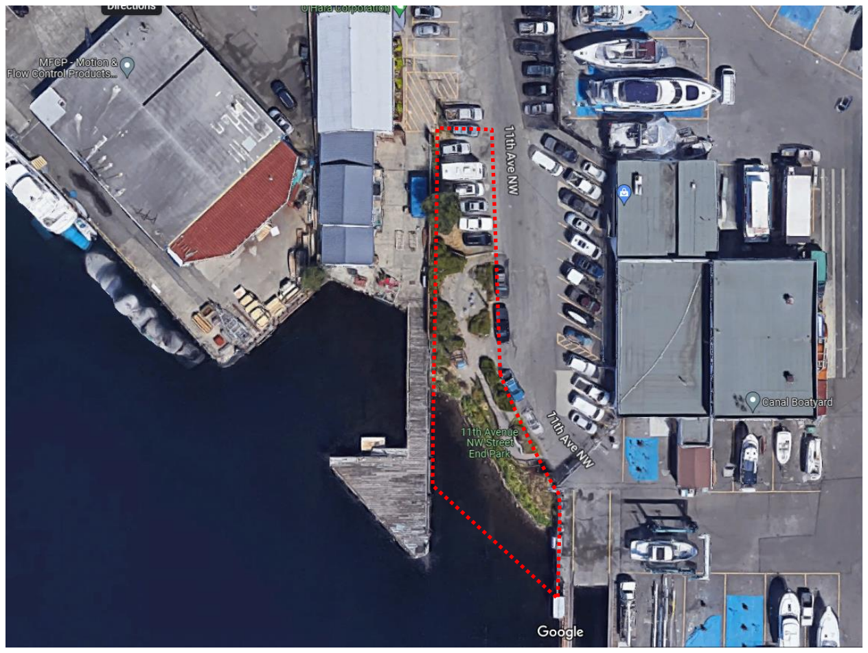
Project Area Map